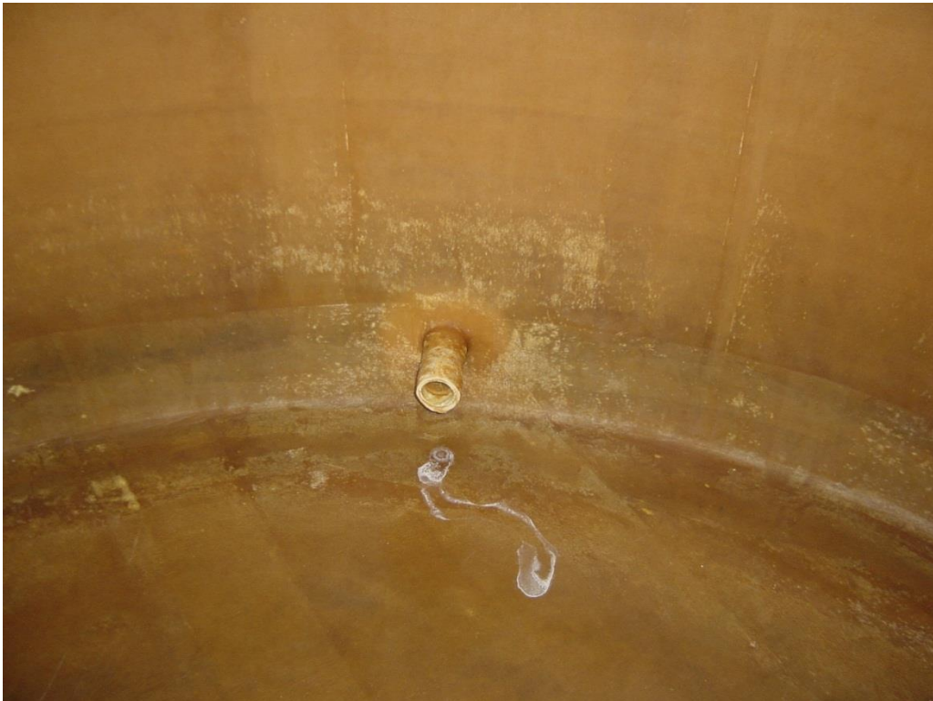
Glendale Tank #2 - 3"±Ø pipe penetration protrusion near tank floor (feed system outlet)