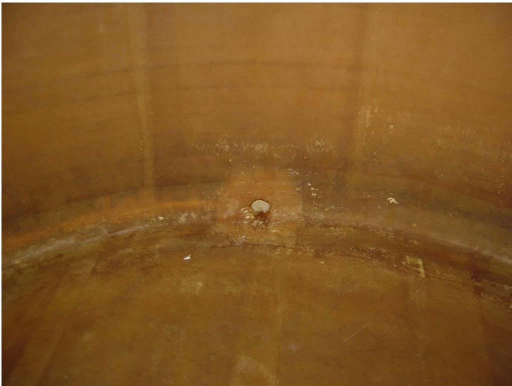
Glendale Tank #2 - 3"±Ø pipe penetration flush with tank wall (tank drain outlet)