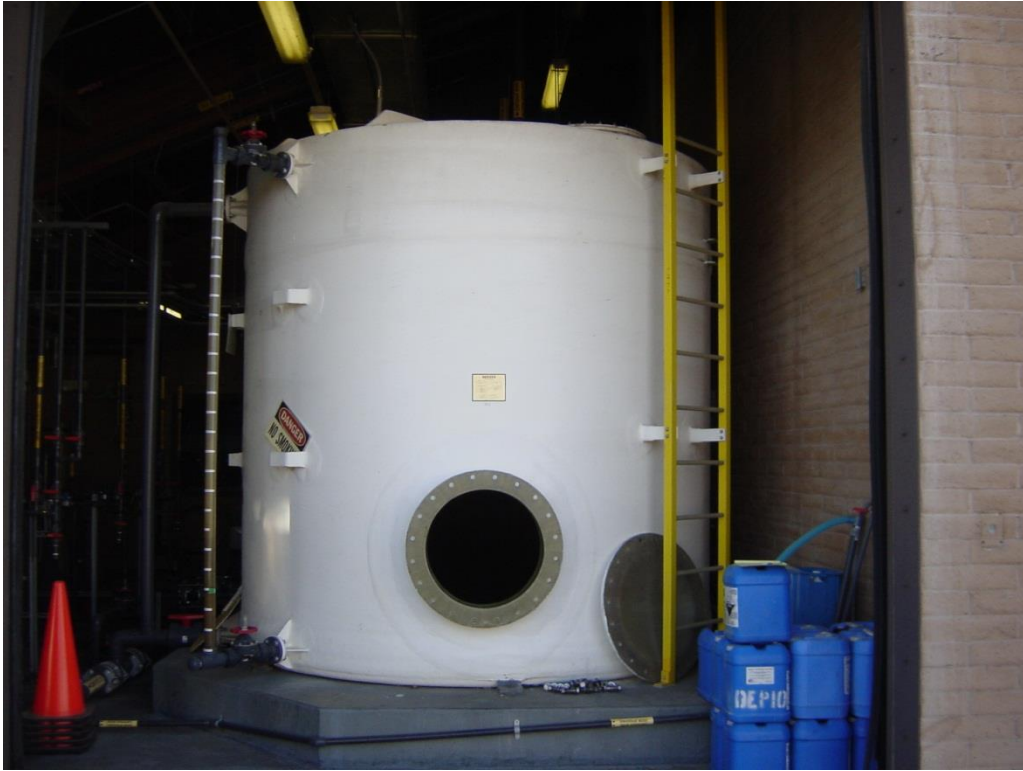
Exterior representation of Glendale Tanks #1 & 2 depicting 24" man-way and ladder