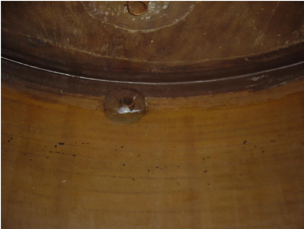
Glendale Tank #2 - 3"±Ø pipe penetration protrusion near top of tank (sight tube)