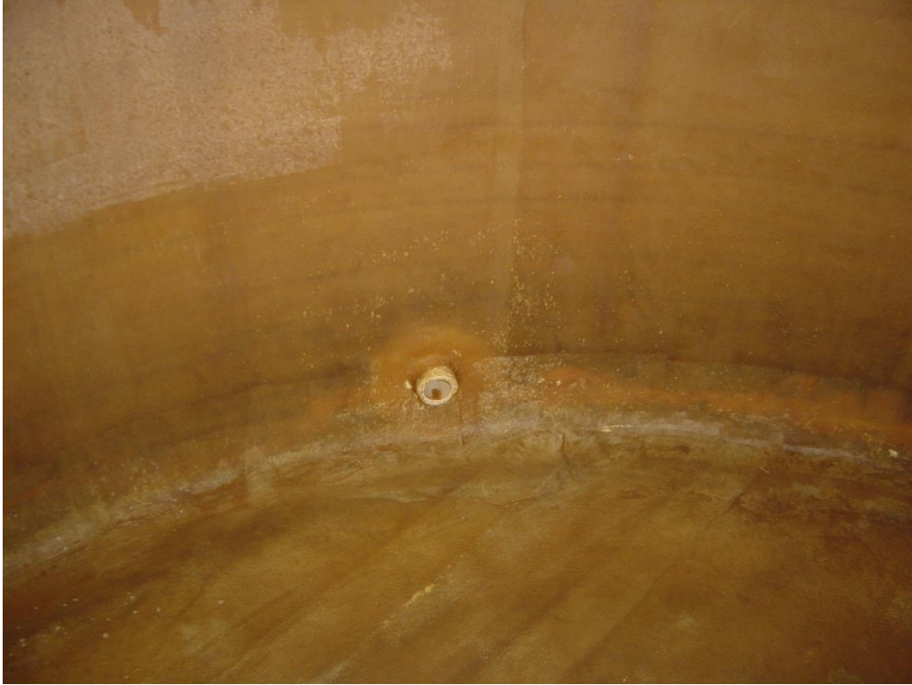
Glendale Tank #2 - 3"±Ø pipe penetration protrusion near tank floor (sight tube)