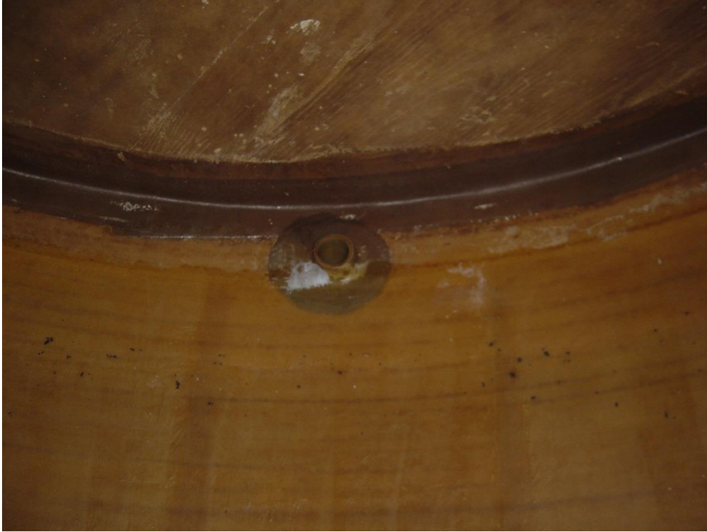
Glendale Tank #2 - 4"±Ø pipe penetration protrusion near top of tank (overflow outlet)