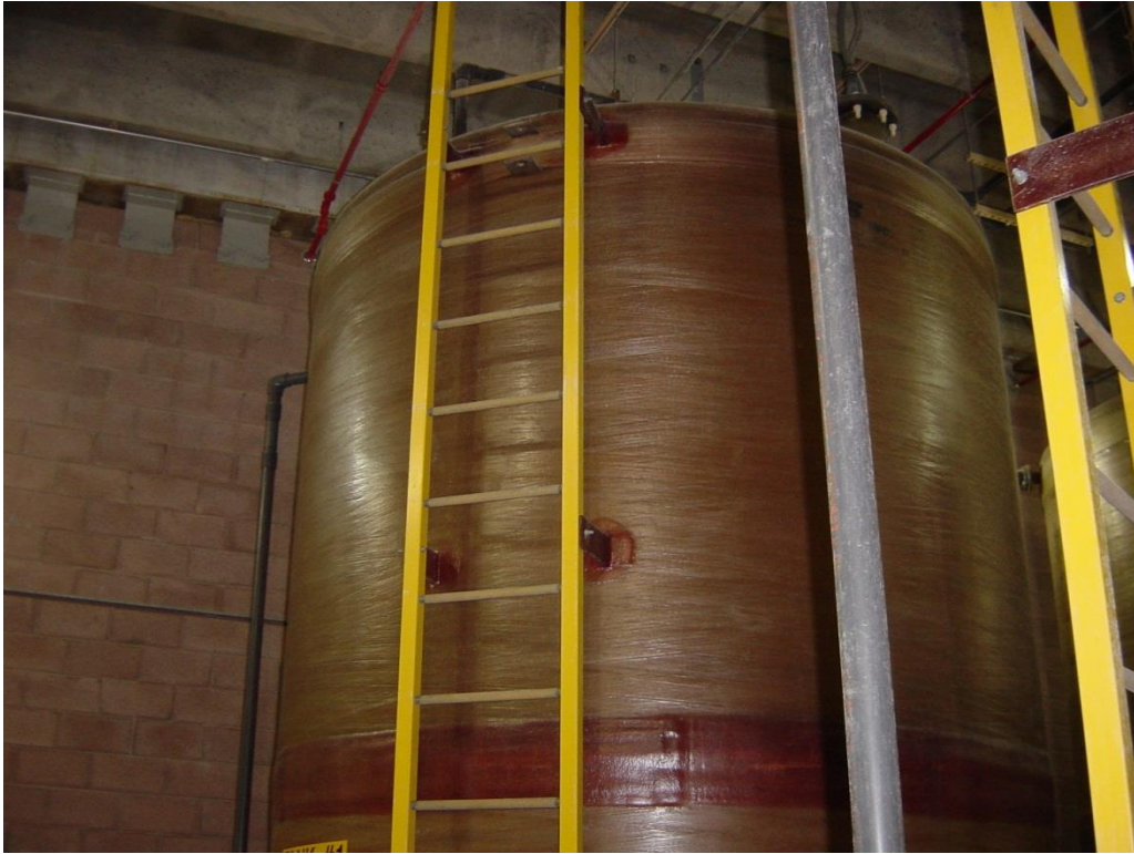
Exterior representation of Chalk Bluff Tanks #3 & #4, showing ladder access to top