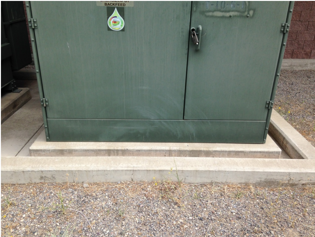
Front view of transformer concrete mounting pad, 98-inches wide