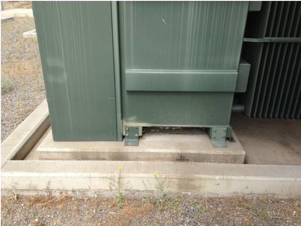
Side view of transformer concrete mounting pad, 74-inches wide