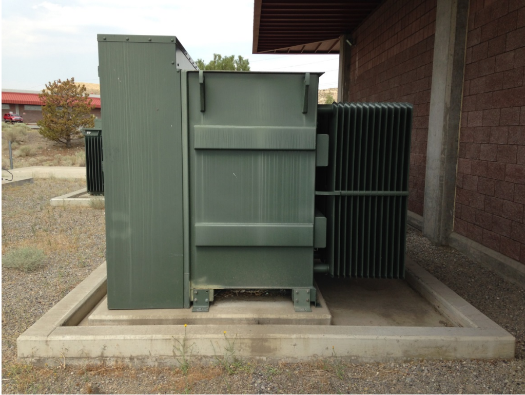
Side view of transformer