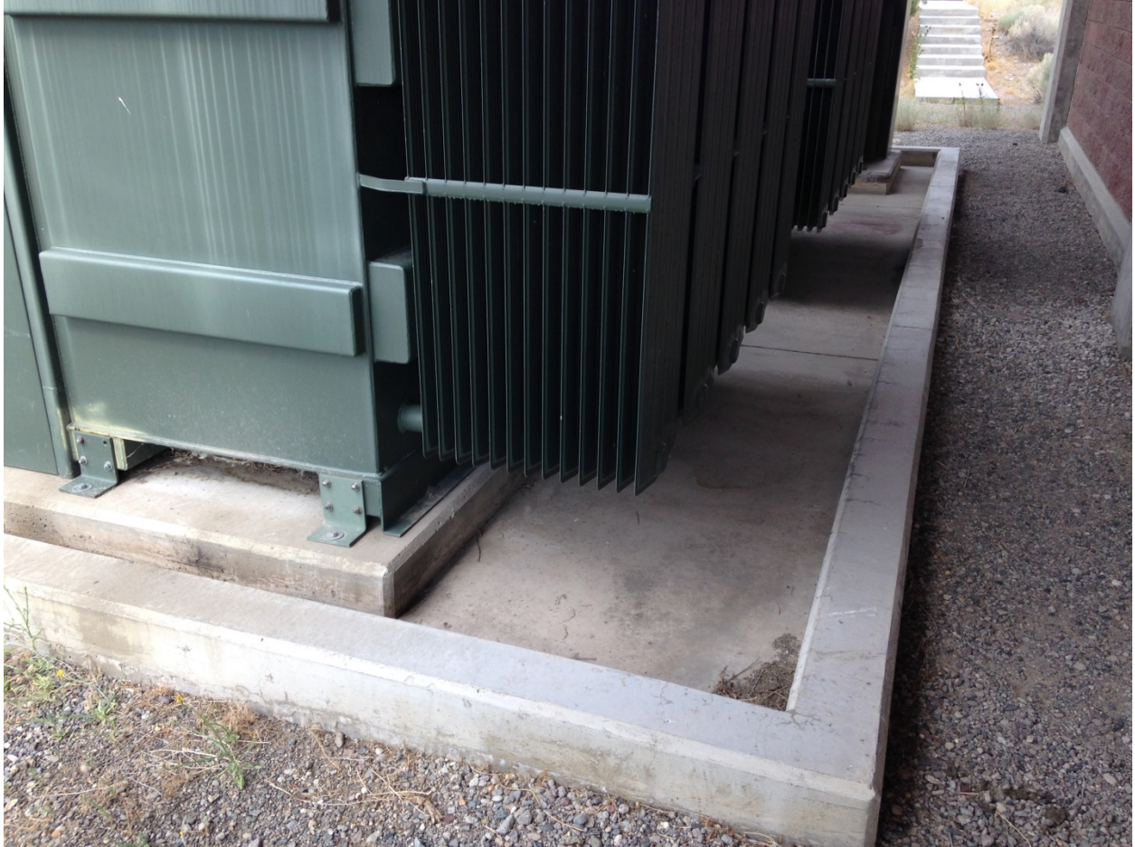
Rear view of transformer with cooling fins extending outside the concrete mounting pad but still inside the perimeter of the containment basin