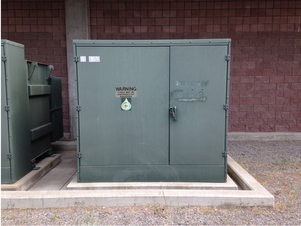
Front view of transformer