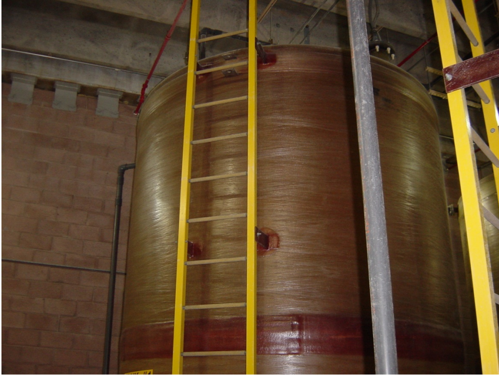
Exterior representation of Chalk Bluff Tanks #3 & #4, showing ladder access to top