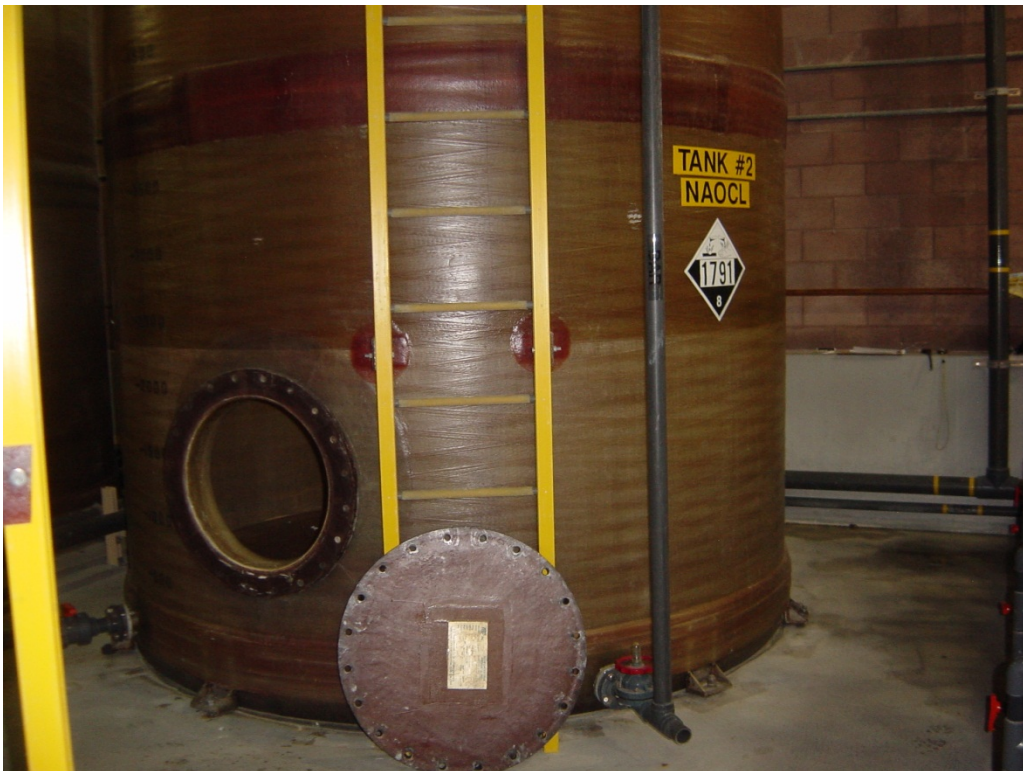
Exterior representation of Chalk Bluff Tanks #3 & #4 depicting 24" man-way and ladder