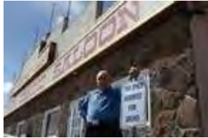
Bruno's for sale