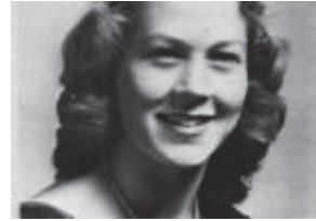
Reno's worst murder