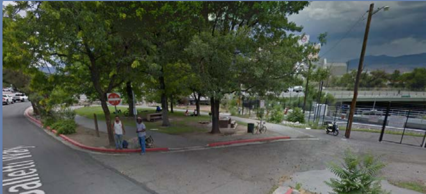
Day Labor workers near Glendale Water Treatment Plant