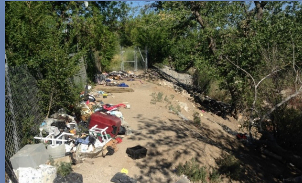
Debris along the River