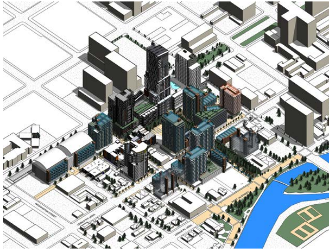
Renderings of the proposed West 2nd District from at final completion showing multiple buildings in west downtown. Facing northeast. Click to enlarge.