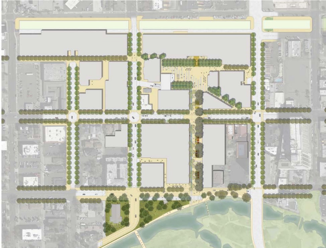
Aerial render of the complete street and green space and park concept for West 2nd District. Click to enlarge.

Through the district, Robertson said they plan to build up to four acres of solar panels to help offset energy needs.